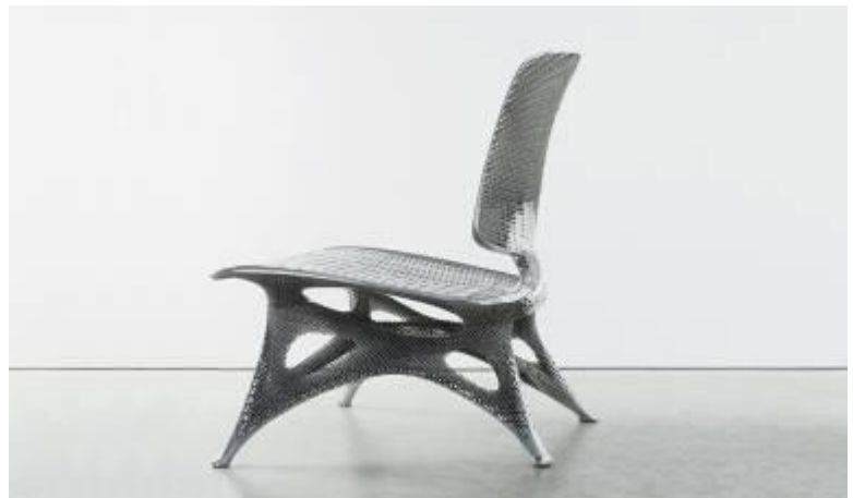
Jolan van der Wiel, OGS-Purple part of Gravity Stool, 2011 Purchased in 2016 Centre national des arts plastiques © Jolan van der Wiel Photo credit: Jolan van der Wiel